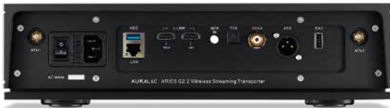
ABOVE: Digital only – the Aries G2.2 offers wired/wireless network control/streaming inputs plus access to more music via internal and external (USB) drives. DSD512 and 384kHz outs are on USB-A, ‘L-Link’ on HDMI, DSD64/192kHz on Toslink, coax and AES

server and a large stream must be transported over the local network).