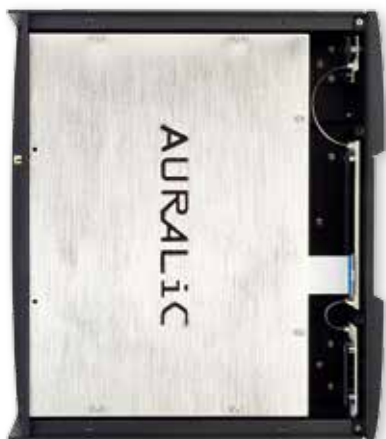
ABOVE: Hidden under the top-plate and screening the digital electronics within is a separate nickel-plated copper enclosure

The Aries G2.2 brought out the two DACs’ respective characters: detailed and crisp for Musical Fidelity’s model, transparent and exact for T+A’s. The percussion in the lively background on ‘Little Margaret’, for example, was a shade more expansive and natural via the DAC200. Determining differences between D/A converters is always challenging, but I felt the Aries G2.2 was aiding the investigative process, not muddying the waters.